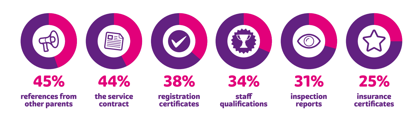
Figure 3: "Did you enquire about (or ask to see) any of the following before choosing a childcare provider?"

45% of parents asked for references from other parents before choosing a provider.