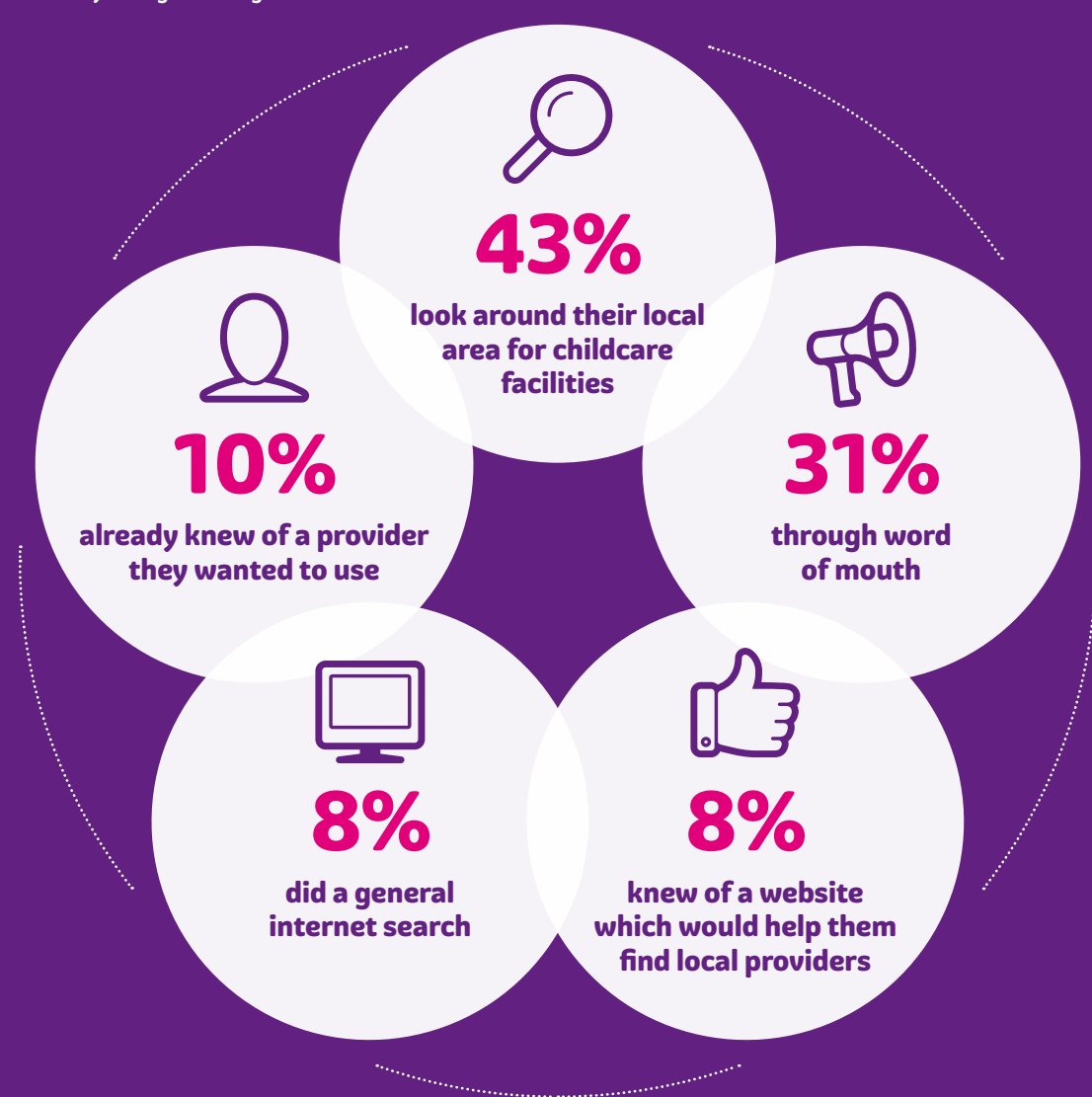
Figure 1: How did you begin looking for childcare?

Figure 1 provides a breakdown of the results.